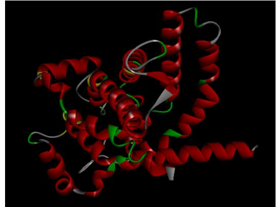
Fig. 2: The structure of Carnitine Translocase viewed under Accelrys Discovery Studio Visualizer

Gene expression values of SLC25A20 gene under normal condition show no signs of over-expression or under-expression of this whereas in diseased state, the gene was observed to be under expressed, that is, 0.003 units lower than its normal value. The study was done using the Array Expression Atlas web server which is collaborated with the ArrayExpress Database