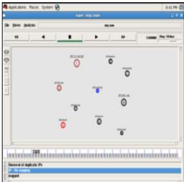
Figure 3 shows Allocation of new IP Addresses

These are the simulation of showing when two or more nodes have same IP address, it is to be remapped and assigned a new mobile IP.