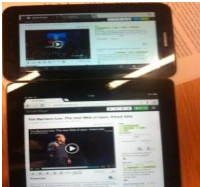
Figure 2. Comparing Galaxy and iPad presentation of Synote mobile

A group of users provided feedback on the prototype of Synote Mobile using 7 and 9.7 inch tablets with Safari, Opera