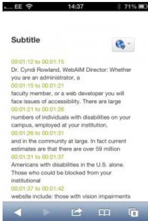
Figure 1. Automated transcript shown on Synote Mobile

Metadata is very important to show the video and audio in the right way on each device. For responsive design, the correct metadata (e.g. encoding, frame rate etc.) is required and multimedia services like YouTube 6 , Vimeo 7 and Kaltura 8 have transcoded services with the metadata already available and delivery is speedy and accurate when it comes to player and device choices. With a web server just delivering multimedia files the entire file has to be downloaded before being able to jump to sections and this takes up bandwidth and slows response times at the delivery point with no guarantee of correct player or device choice. There needs to be another service to carry out the transcoding on the fly and this might be possibly implemented by a cloud to cloud service. High level metadata is about how the user interacts with the annotations and how the user sees the media with standards such as HTML5 tracks, accessibility information, schema.org and open graph plus information around the user annotations e.g. notes, comments, captions etc. Combining all the elements regarding the metadata categories and their content would give a truly responsive design for Synote mobile but incomplete HTML 5 and metadata standards make this difficult to