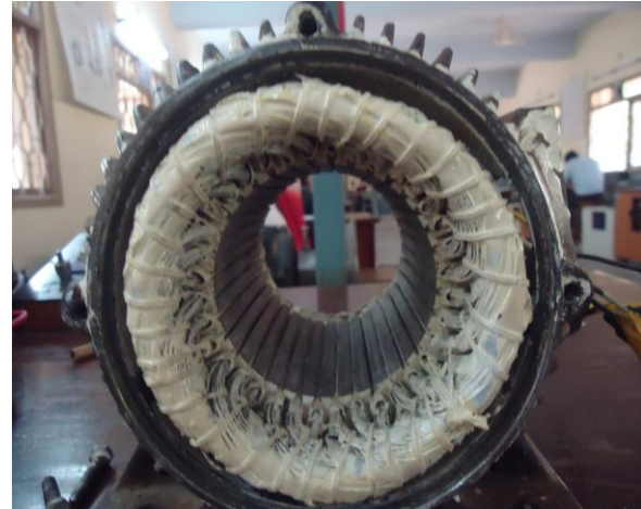
Figure 2 Nanocomposite filled enamel coated induction motor