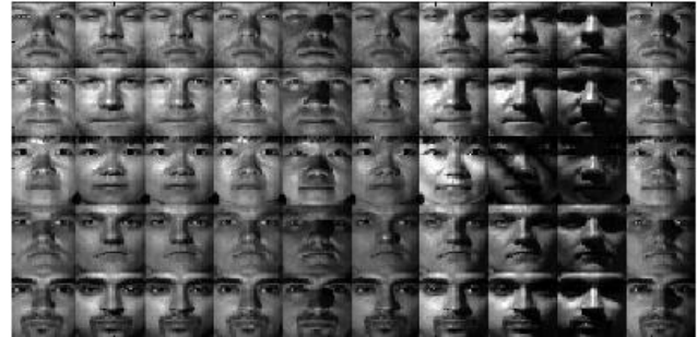
Fig.3 Pre-processed Sample face Images

We applied the proposed new face recognition method on YALE face datasets for separation of ten classes. We cropped the input images to reduce their size to 40×40.