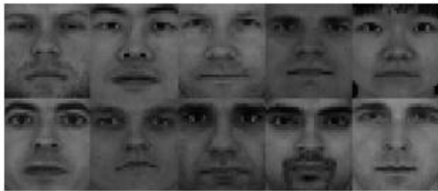
Fig. 2 Mean images related to our selected faces. Finally all preprocessed face images change to a vector (1600 X 1 vectors) and go to the next step. For complexity and memory size reduction, mean image is computed.

As a next step, we subtract mean images from face images to mean center all of them. Fig. 2 shows mean images of face images that used in our experiments.