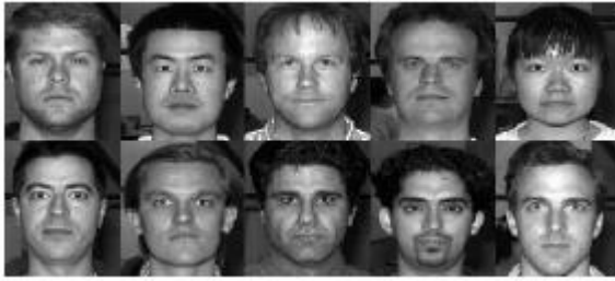
Fig. 1 Sample Face images that used in our experiment

background information that is not useful for recognition, Figure (1) shows some face images with background information)