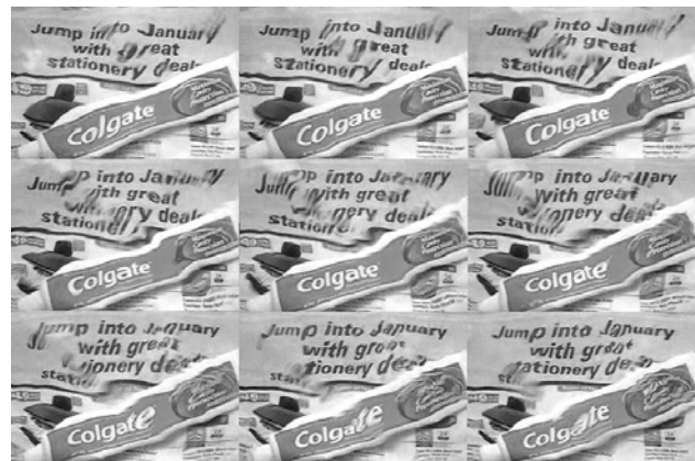
Fig. 1. A sample sequence of distorted images.

is the average-based method, which temporally averages the data stream [1]. Another method is to locate the minimum distorted regions and form the final image from these regions [2, 3]. Both methods work well in many situations. The latter method works better under severe disturbed conditions.