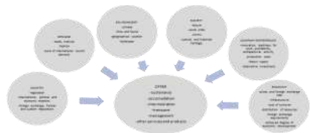
Figure 1: Elements of the tourism market