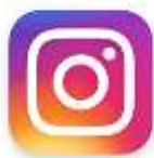
Figure 6. Instagram logo