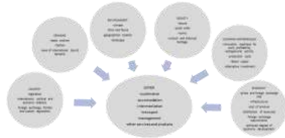
Figure 2: Factors affecting the forming of the tourist offer