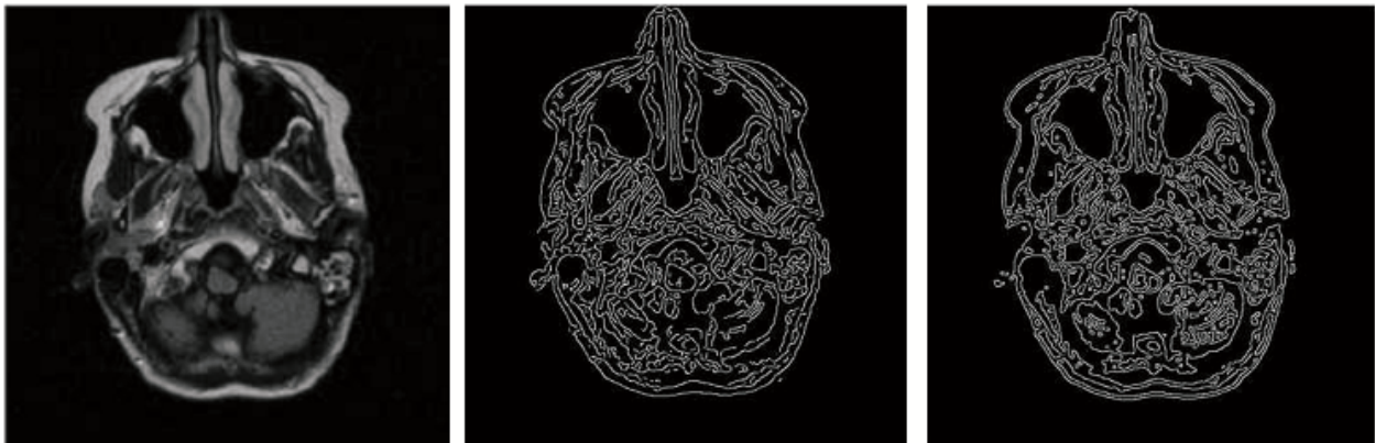
(a) (b) (c) Figure 2. (a) Original Image (b) Ordinary Canny Algorithm (c) GAFCM with Canny algorithm