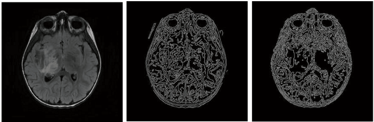
(a) (b) (c) Figure 3. (a) Original Image (b) Ordinary Canny Algorithm (c) GAFCM with Canny algorithm