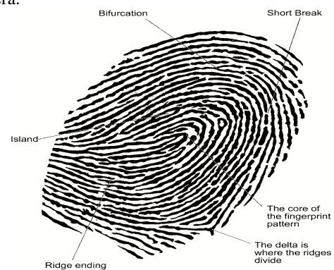
Fig.3. Fingerprint with labelling

Face is one of the most acceptable biometrics because it is one of the most common methods of identification which humans use in their visual interactions. Facial disguise is of concern in unattended authentication applications. It is very challenging to develop face recognition techniques which can tolerate the effects of aging, facial expressions, slight variations in the imaging environment and variations in the pose of face with respect to camera.