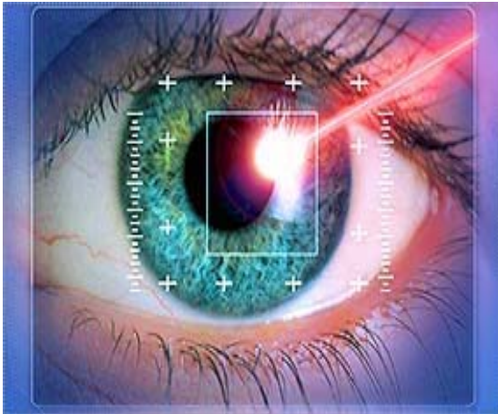
Fig.3. Identification based on Iris

Visual texture of the human iris is determined by the chaotic morphogenetic processes during embryonic development and is posited to be unique for each person and each eye. An iris image is typically captured using a non-contact imaging process. Capturing an iris image involves cooperation from the user, both to register the image of iris in the central imaging area and to ensure that the iris is at a predetermined distance from the focal plane of the camera.