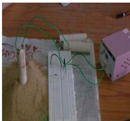
Figure1: Diagram of the soil moisture sensor

relationship that exists between water content and gypsum. The key success of the sensor viz. Gypsum is the number of hydrated molecules. The impedance property of the crystal is a function of the no. of hydrated molecules present. Therefore the uniqueness of the approach lies with the number of water of crystallization.