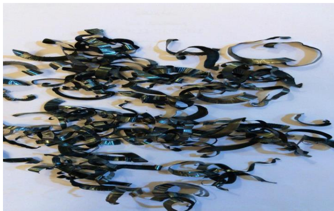
Figure 3: The hooked-end industrial steel solid wastes.

The mixing process is summarized in Figure 4. Each specimen was made on 3 layers, where is each layer was compacted using a 380 mm long steel bar that weighs 1.8 kg and a 25 mm square end for ramming [7]. Each layer received a minimum of 35 uniformly distributed strokes [8].