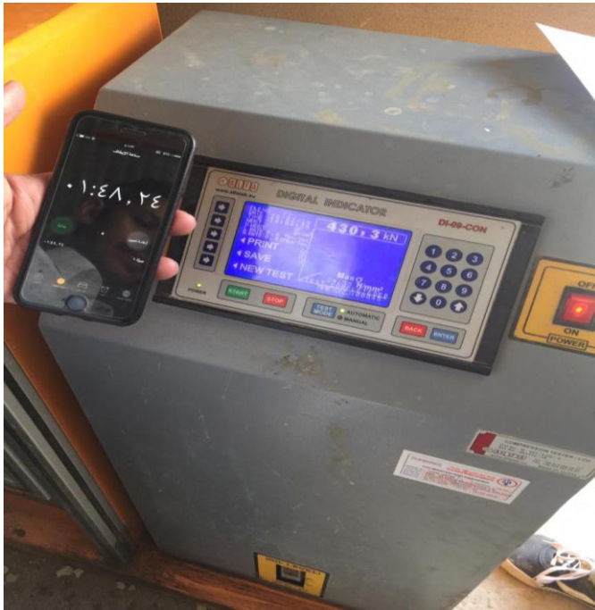
A) Plain concrete (0% added waste steel fiber)