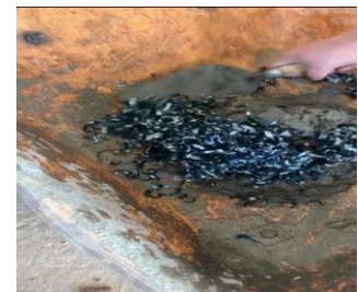
B) The steel fibers are added to the plain concrete