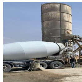
A) The plain concrete is casted

Table 2 document the results of the compression test (Figure 5) carried out for the casted and cured concrete cube specimens with and without adding the waste steel fibers