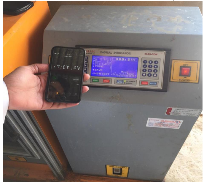
C) Plain concrete (2% added waste steel fiber)