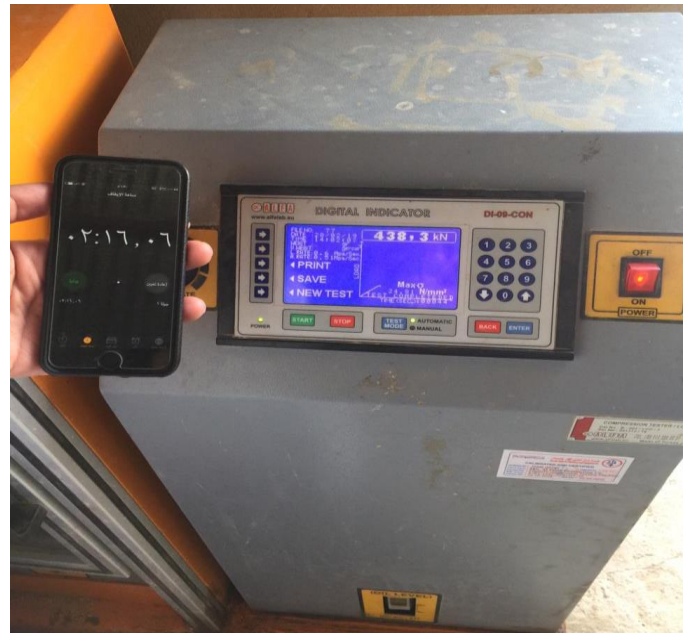
B) Plain concrete (1% added waste steel fiber)

Exploiting the industrial steel waste in improving the casted concrete, in terms of compressive strength, is an environmental-friendly use of steel lathes since a large quantity of is generated from industrial lathes (3-4 kg/lathe/day).