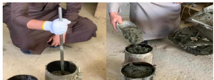
C) The cylinder/cubic molds were used and the concrete specimens were casted on 3 layers