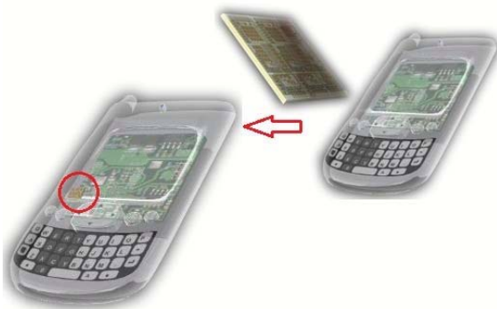
Fig. 2 Gi-Fi chip in mobile device

The GiFi chip is the first transceiver in the world that is integrated on a single chip and operates at 60GHz on the CMOS (complementary metal-oxide-semiconductor) process and delivers short-range multi-gigabit data transfer in an indoor environment. It is a complete wireless system on a single integrated circuit that provides around ten times the bandwidth at one-tenth the cost of existing technologies such as Bluetooth and Wi-Fi. The integration of the existing technologies is shown in fig. 3.