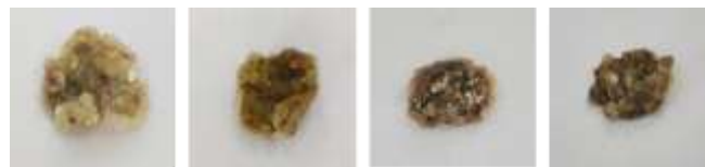
Figure 1. Calli from leaf explants of Ehretia asperula Zolliger et Moritz cultured in a) MS, b) 1/2MS, c) WPM and d) B5 media

The addition of BA (0.1mg/L) and 2,4-D or NAA stimulated the formation of callus (Table 4). With the addition of BA (0.1mg/L) and NAA, the callus induction rate was 100%. For 2,4-D, the concentration of 2.0 and 2.5 mg/L resulted in no statistically significant differences, with callus induction rate over 90% and callus diameter 17.00-18.33mm. After 24 days, the callus browning began.