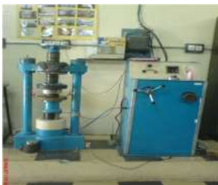
Figure .1 The high pressure set-up used for the measurement of resistance using Bridgman opposed anvils up to 10 GPa.

The sample is contained in a pyrophyllite gasket with talc as pressure transmitting medium [11]. Pressure was calibrated with bismuth transitions at 2.5GPa and 7.65 GPa. The pressure was generated by a hydraulic press on the Bridgman type tungsten carbide opposed anvil apparatus with Bismuth pressure calibration as shown in Figure 2.