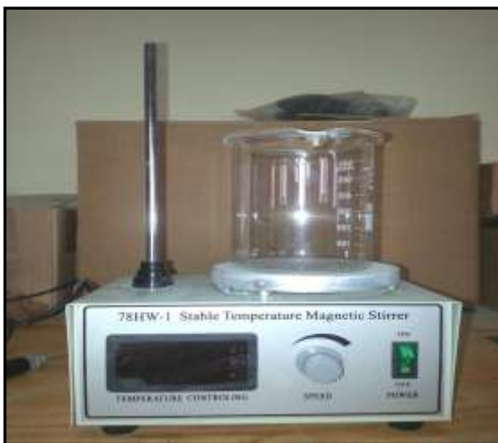
Fig. 1: Stable Temperature Magnetic Stirrer.

To fabricate the mixtures of the second phase (six OPC/NS concrete mixes), SP is firstly mixed into MW in a mixer, and then NS is added and stirred using the magnetic stirrer, Fig. 1 shows the magnetic stirrer used in this research.