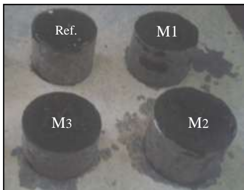
Fig. 2: Specimens used for measuring % chloride penetration