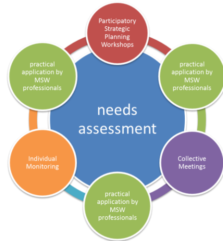
FIGURE 2 CAPACITATION METHODOLOGY

were directed to two professionals from each municipality team (focal points). These professionals, usually representatives of the City Hall and of the Social Security Institute were also the ones with more time assigned to this programme.