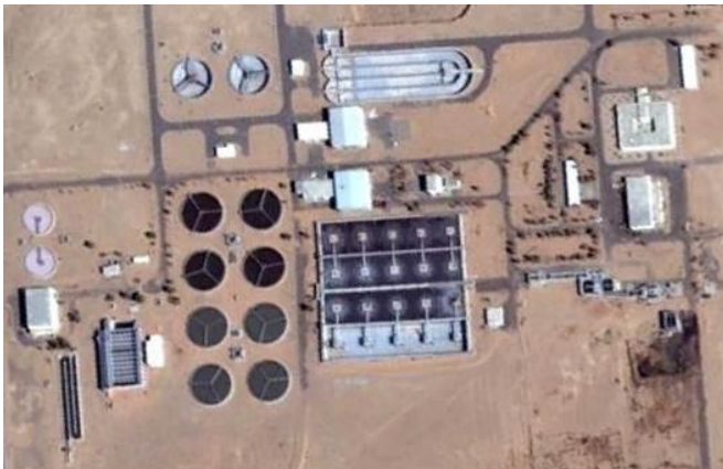
Figure 1. General layout of Tabuk Wastewater Treatment plant.