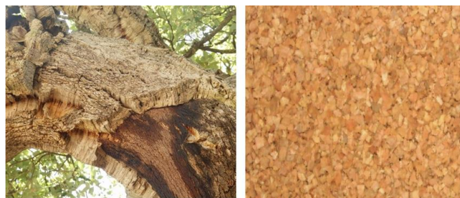
Figure 1. Cork oak;

Natural cork has a similarly low environmental impact; it is the undisputed leader among thermal insulation materials of plant origin, since it has proved superior to other products in this category. This material is obtained from cork oak ( Quercus suber ) by skilfully harvesting its bark approximately every 10 years (Fig. 1). Harvesting the regrowing layer of dead oak bark is an excellent example of sustainable approach to natural resources and of respect for nature.