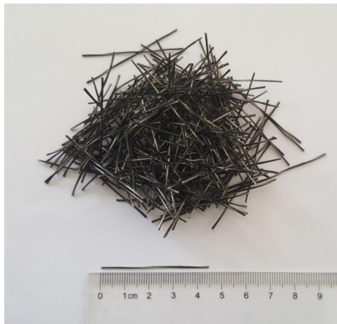
Figure 1: The discrete basalt fibers

An ordinary Portland cement type 1 was used in the mix. The washed sand was used as the fine aggregates, while Gabbro aggregates were used as the coarse aggregates with a maximum size of 20 mm. The water/cement ratio of the mix was 0.34. The target strength of concrete was 50 MPa. Two different volume fractions of basalt fibers namely 0.75%, and 1.5% by volume were added. The basalt fibers can be shown in Fig.1.