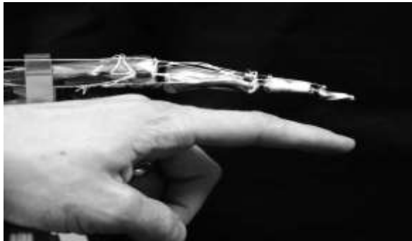
Figure 2. Anatomically Correct Testbed (ACT) index finger.

machinery [4]. Testing and evaluations are undertaken against the live biological model. In present engineers can develop bio-inspired physical implementations which are perfectly similar to the actual biological models. Anatomically Correct Testbed (ACT) index finger (Figure 2), BLEEX exoskeleton and Utah Arm can be provided as examples [4,23].