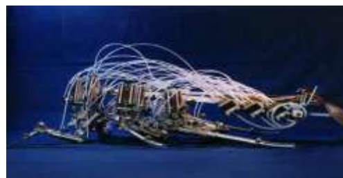
Figure 1. Robot III, hexapod modeled based on the structure and function of a cockroach.

In order to develop biologically inspired robots, first scientists and engineers must conduct a thorough and well-specified analysis and research of their biological build-up. The research must study the mechanism of the motions, energy levels, censoring, muscle memory or neural memory and the biological structure of the relevant biological and that makes this process more complex. According to engineers, this phase of analyzing phase is the most complicated one than implementations [8]. As examples, The Sprawl robots, hexapods grounded on the biomechanics of cockroaches, have been precisely premeditated to contain compliant features as their biological model (Figure 1) [1]. And prosthetic arms and other prosthetic devices are developed exactly allowing the emulating behavior and performance of real muscles of humans [4].