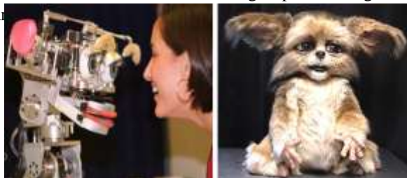
Figure 5 To the left is Kismet. To the right is Leonardo, the successor of Kismet by MIT

• Pearl -Pearl is aimed most severely on purposeful assistance which is one of the four most-cited and studied robots, Pearl is the one of the second group of nursing bots advanced