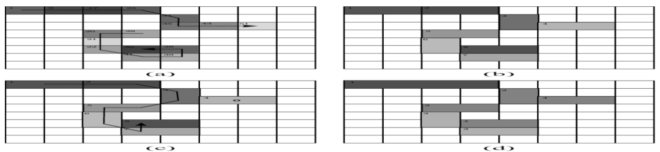
Fig. 3. (a) Numbered pixels belong to the shrunken difference image that we consider, the first path is indicated. (b) Index sets after applying the EPWT once. (c) Second path. (d) New index sets.