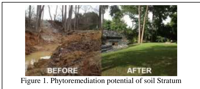
Figure 1. Phytoremediation potential of soil Stratum