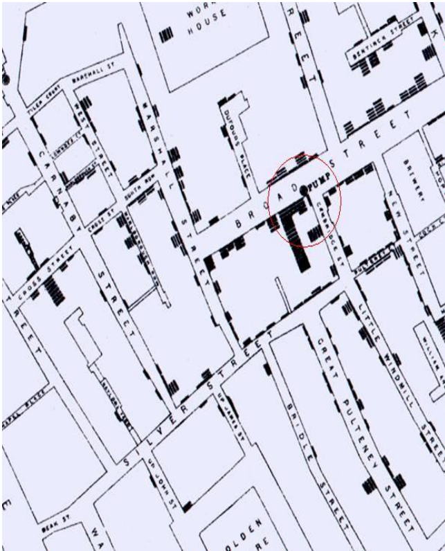
Figure 2. Bar chart plotted on map of London.

Snow counted the number of deaths caused by cholera and plotted the victims' address on the map of London as black bars. He discovered that most of the deaths clustered towards a specific water pump in London (shown by the red circle in Figure 2).