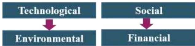
Figure 1 Factors used in the assessments of SWOT analysis

The strengths & weaknesses and opportunities & threats on the basis of different factors for direct combustion, pyrolysis, gasification and plasma-based gasification are determined.