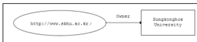
Figure 1. An Example of RDF graph

The basic block of RDF consists of three object types - resources, properties, and statements. A resource is anything that can be written as a Uniform Resource Identifier (URI) in the RDF expression. It can be not only a Web page but also an XML element. Anything written in URI could be a resource. A property is a specific characteristic, attribute, or relation of the resource - for example, "owner." Each property has a specific meaning, which can be classified by a schema related to the name of the property. A statement is a combination of a resource, a property, and a value. Each part of a statement is also known as the subject, the predicate, and the object. The object can be another resource or a literal, which might be any string or XML. Figure 1 presents an example of RDF graph for the Web page of the University.