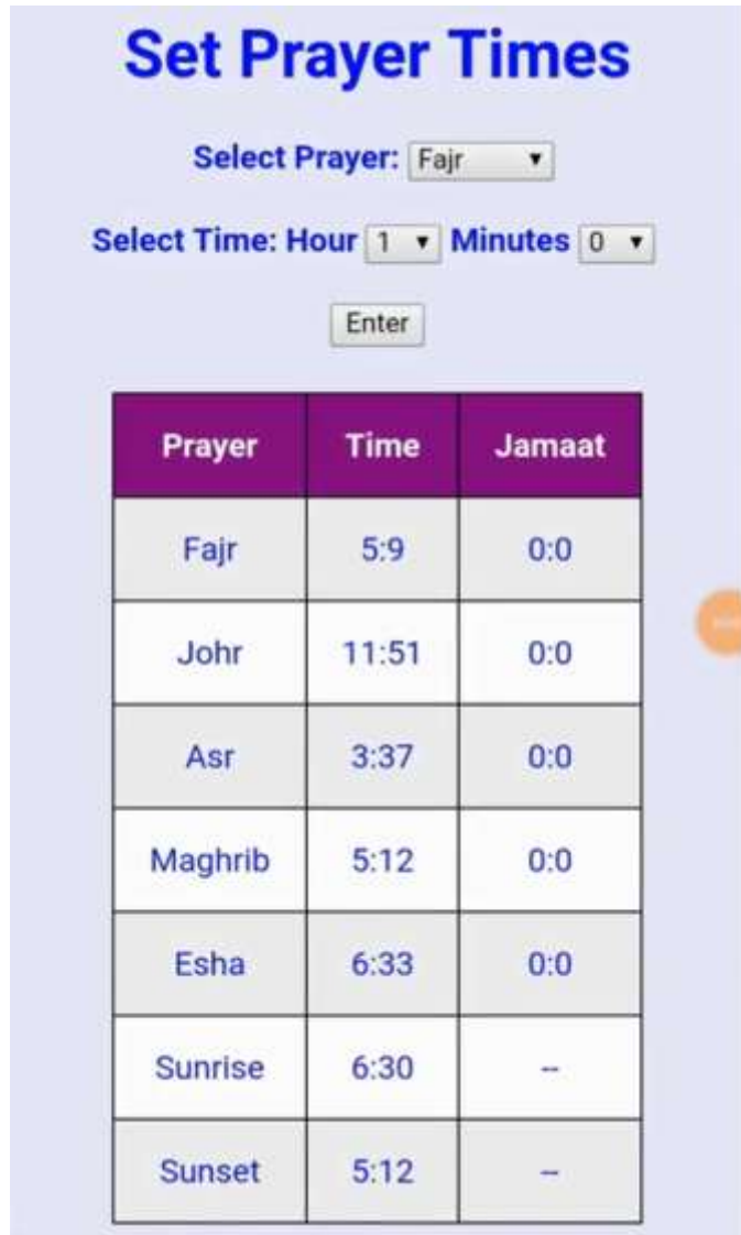
Fig. 2: Web interface for Jammat time input

along with two additional sunrise and sunset time. Therefore, in total