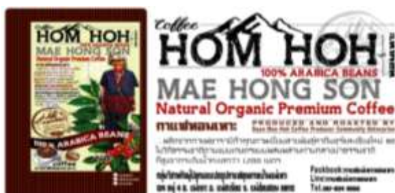
Fig 1. The basic elements of Hom Hoh brand.

1. The result of the development of Arabica coffee products under the Hom Hoh brand can be shown in figure 1;