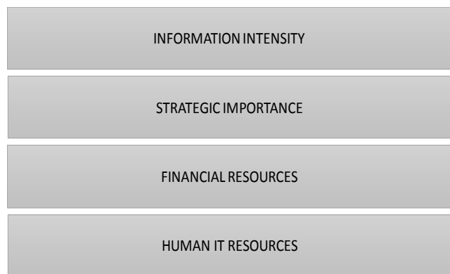
Figure 1. Background factors

These tasks are different in different organizations, depending on the role of technologies and information systems in the organization. It is notable that the resources impact the way information systems development and management tasks can be organized. The most relevant background factors include the strategic importance of IT [4] [5] [6], information intensity [7] [6], human IT skills [8] [9] [10] [11] and financial resources focused to information systems [6] [12].