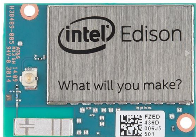
Figure: Intel Edison

2) Intel Edison: The Intel Edison is a computer-on module designed with two different processors built in to get better performance. The module is designed to be as small as a SD card and contains dual core Intel Atom CPU at 500MHz and Intel Quark micro controller at 100MHz.The module comes in a 70-pin flat package with a 70-pin Hirose connector to be connected to different available breakout board. It contains everything needed to support the micro controller. The Intel Edison can be programmed using Arduino IDE (Integrated Development Environment) and also supports C++, Python, etc.