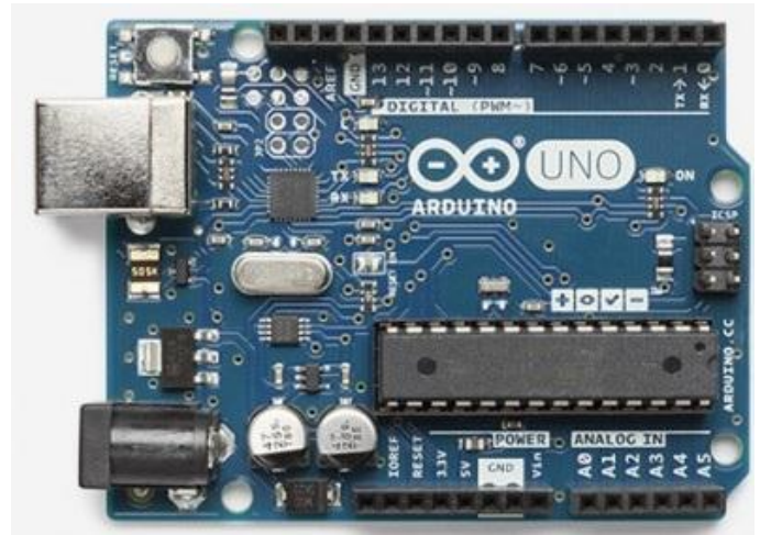
Figure: Arduino Uno

1)The Arduino Uno R3 is a micro controller board based on the ATmega 328P.It has 14 digital input/output pins (of which 6 can be used as PWM outputs), 6 analog inputs. Additionally, it supports a 16 MHz crystal oscillator, a USB connection, a power jack, an ICSP header, and a reset button. It contains everything needed to support the micro controller. The Uno is compatible with most shields designed for the Arduino/genuino boards. The Arduino Uno 328p is programmed using the Arduino Software (IDE), Integrated Development Environment..