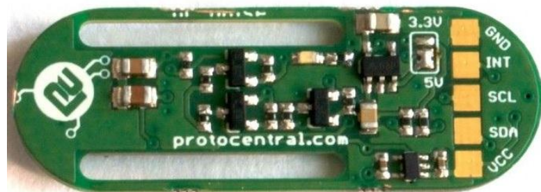
Figure: Pulse Oximeter Sensor(MAX30100)

MAX 30100 operates from 1.8-3.3 V and can be power down with negligible stand by current. It has high SNR value providing robust motion with high sample rate and fast data output capability. It provides SpO2 level with the help of estimating the amount of oxygenated blood level by passing the IR light through the finger and the device is I2C compatible.