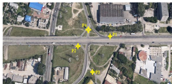
Figure 10. a) Point location P1-P4

Control point determinations were made by stationing on each point for one minute with a number of 10 readings. The distance between points P1, P2, ..., P7 is located between 30 and 140 \text{ meters} (Figure 10 a, b).