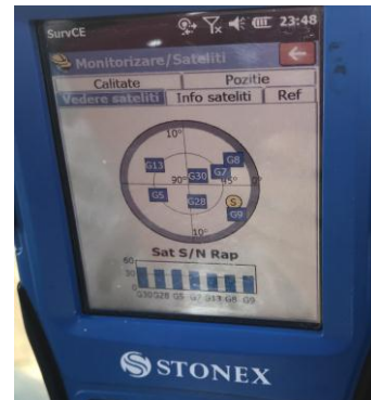
Figure 9. Satellites during measurement process

Stationing in each control point (P1, P2, ..., P7) I read the positions of the points with the following constellations: GLONASS, NAVSTAR-GPS, BeiDou and all satellites listed simultaneously (Figure 9).