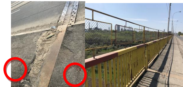
Figure 5. Location of the marks on the viaduct

We are proposing a monitoring behaviour in service stage network made up of monitoring marks on the viaduct, control points, station points from which we will read the vertical movements of the structure and the orientation points with known coordinates. The location of the viaduct marks (Figure 5) are placed at the ends of the objective joints at approximately 150 meters from each other on both sides of the structure. The monitoring marks are in number by two at the end of the joint on one side and the other. The total number of landmarks on the viaduct is 40 markers.