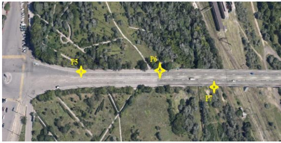
b) Point location P5-P7

Table 1 shows the coordinates of the control points determined with all satellite constellations, as well as the errors on the three directions X, Y and Z on the constellations of the individual satellites NAVSTAR-GPS, GLONASS, Bei Dou.