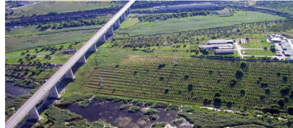
Figure 3. Viaduct – sky view