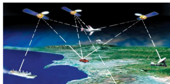
Figure 1. GPS System [5]

On the other hand, the Galileo European System is connected to the GPS / NAVSTAR and GLONASS satellite constellation to provide a high precision of determination of point positioning. The reference and coordinate system used is ETRS89 (European Terrestrial Reference System), consisting of 30 satellites. The Galileo System is considered superior to the GPS (Figure 1) because it provides horizontal and vertical measurements with a precision of 1 meter (D. Lepadatu, 2016) (D. Lepadatu, D. Covatariu, L. Judele, G. Săndulache, A.R. Roșu, M. Diac, 2014) (J. Neuner, 2000).