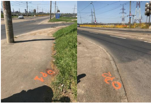
Figure 6. Control points

Thus, the accuracy of each constellation will be obtained and we will be able to choose the most accurate position of the point. They will be located outside the viaduct's area of influence so as to ensure visibility between the network's control points and the station points from which we will read the marks on the objective.