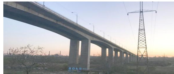
Figure 4. Viaduct – pillar view

Vertical spatial displacements were produced also due to the significant earthquakes of 1977, 1986 and 1990, but also to the heavy traffic that caused the structure to weaken. Therefore, the permanent monitoring of the objective is recommended to be done by using modern and accurate surveying methods (Lepadatu et al. 2016, b).