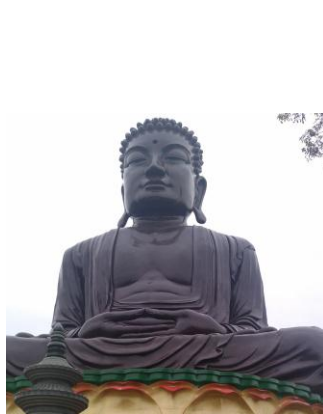
Fig. 2 The appearance image of the checkpoint.