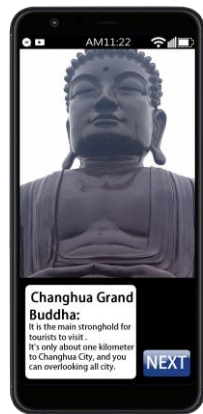
Fig. 3 The appearance image of the AR app.

The development process is to first take the appearance image of the checkpoint such as Fig. 2. Then upload the image to the database of Qualcomm Corporation's cloud server. The server will use the image to create a marker for image recognition. When the smartphone's camera recognizes this marker in the real world while running the AR app, it will augment the digital objects such as text, graphics and buttons onto the real-world environment on the smart phone screen as shown in Fig. 3.