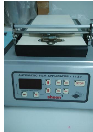
Figure 6 - Image of the automatic film applicator.

substrate. The coating will be applied by automatic film applicator. This machine uses motorized method of driving wire coating bars across the substrate at constant speed (Sheen, 2006). The coating bars control the thickness of the coating which ranges from 50 to 300 \mu\text{m} . This instrument speed range is from 50 to 500 \text{mm}\cdot\text{s}^{-1} with increment of 10 \text{mm}\cdot\text{s}^{-1} . Figure 6 shows the automatic film applicator. After selecting the suitable coating bar and setting the speed, the coating process will be started by controlling the forward and return button.