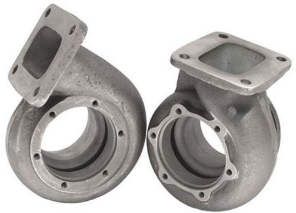
Figure 1 - Image of turbocharger turbine volute casing

Apart from turbocharger turbine, the casing itself plays an important role in controlling the heat flows from the exhaust to the shaft and compressor. Burke et al. (2015) studied on the heat transfer in the turbine at transient state showed that thermal inertia of the casing gives big impact on the heat flows due to temperature difference between the exhaust gas and the turbine wall. Furthermore, a study also stated that high surface temperature of the turbine casing losses 26 percent of total power output through convection and radiation (Verstraete, 2013). These show that further study on heat transfer need to be done on the volute casing in order to reduce the heat lost and increase the turbocharger overall performance. Figure 1 shows the image of a turbocharger turbine volute casing.