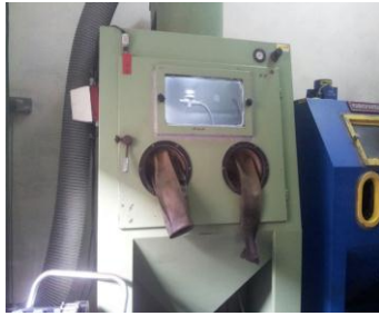
Figure 4: Image of the sand blasting machine.