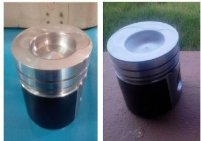
Figure 2 - Snapshots of uncoated baseline engine piston (left) and YSZ coated piston (right). (Sivakumar and Senthil Kumar 2014).

Table 3 shows some of the common properties of Zirconia (ZrO 2 ). As shown in the table, Zirconia has the lowest thermal conductivity value compared to SiC and Si 3 N 4 ceramics. It makes ZrO 2 ceramic the best candidate for thermal insulation materials. Application of ZrO 2 ceramic in TBC is well established for its many excellent properties such as ultimately low thermal conductivity, high thermal shock resistance, extremely high melting point, and good wear and corrosion resistance at high temperature (Gosai and Nagarsheth, 2014; Keshavarz et al., 2013; Ahmadi-pidani et al., 2014). In order to maximize its performance as TBC, ZrO 2 usually doped with oxides. Y 2 O 3 is the most commonly used oxides to stabilize ZrO 2 . The mechanical