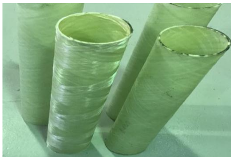
Figure 1. The four types manufactured specimens

measurements of the length, wall thickness and internal diameters and the corresponding coefficient of variations C.O.V. are listed in Table II.