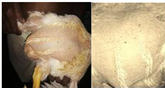
Figure1. Original Image and Region of Interest

The result for segmentation the process of removing remaining spurious and the overlapping of contour can be shown in the below figure