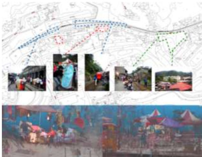
Figure 5. Lantern booths and the point cloud representation