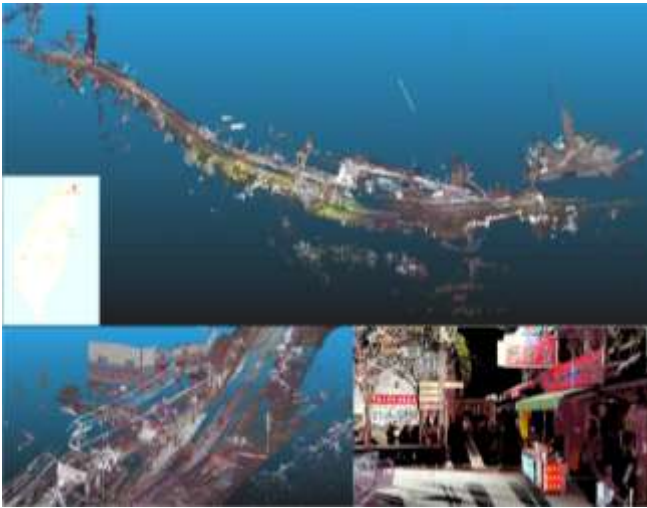
Figure 1. Point cloud of Jingtong scan-based map (top) and the scenes around railroad and old street (bottom)