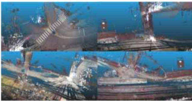
Figure 2. The top views from the street entrance to train station