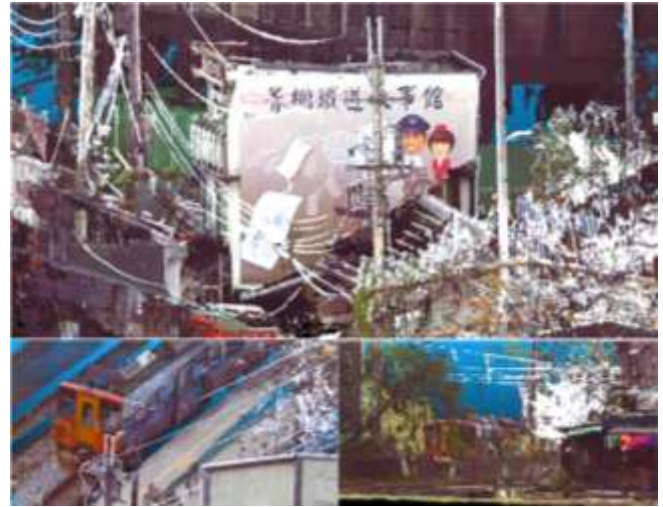
Figure 3. The point-cloud-based urban and railroad images

as from A to E (Fig. 4). The results show a number of types of boundary and adjacency next to railroad, from a highly enclosed corridor near the street entrance to an open space between residences and hill. Among which, temporary installations like canopies and panels are applied by local shops to define their shop front and to shape the major street scene of Jingtong.