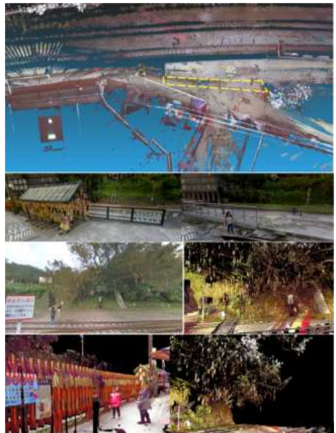
Figure 6. The reallocation of bamboo tubes in 2012 and 2015 (top), referred by scan data, and the hanging bamboo tubes on fence and trees (bottom)

The interaction between local icon and wish-projection behavior leads the small town being evolving to a scalable setting. It seems tourists have created a new behavior pattern by assigning specific meaning to the space near old street and railroad. Not only the shops or booths deploy accordingly to meet the population of tourists, but the landscape and open space are used for wish-making like hanging tubes and flying lanterns. Although warning sign is installed, taking pictures with the railroad has become part of the visit.