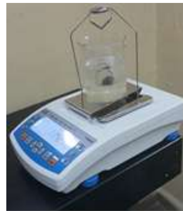
Figure 3. The density measurement of the friction composites

The compression test was conducted on a special design (Kale Balata Pad factory) during 3 seconds, strength testing machine of 160 bar capacity. Shear strength for the qualification of brake pad integrity along the force was measured on a new design testing machine from Kale Balata Factory. The test were applied according to ISO 6310 [17] and 6312 standards [18].