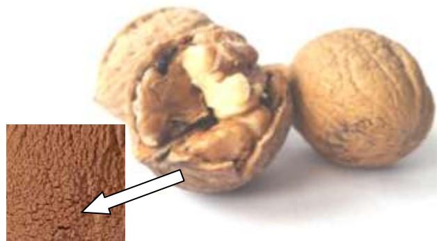
Figure 1. The walnut dusts

Walnut shell dusts were used during the current study as a friction adjuster material. Walnut dusts were first pulverized, sieved and dried in oven at 100 °C for about 1 h. The granule size of the walnut dusts is approximately 250-400 µ. Wollastonite grain size is 125-250 µ. The type of walnut and its dusts are shown in Fig 1. The composition of eco-friendly friction samples is listed in Table 1. All raw materials were mixed with an industrial mixer for 10 min, followed by molding and hot pressing at 180 °C and 10 MPa for 6 min in a hydraulic press. The pressed brake pads were freely held within an electric furnace which has air-circulation in temperature from 300 °C to 150 °C during 10 hours. After post-curing, the brake pads were finished by polishing them using polisher-grinder with various grinding paper of various sizes to obtain the final products.