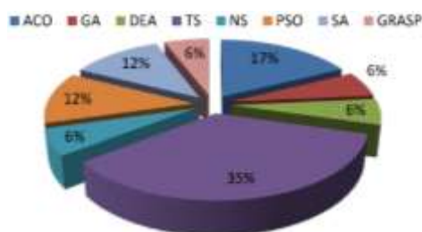
Figure 2. Frequency of AI techniques in VRP