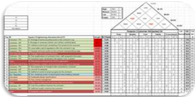
Figure 2. First -Roof House of Quality

Fig. 2 below shows how the customer attributes such as time, cost, quality, safety and environment have inter-relations between each one of them. Hence, relation degrees have been interpreted in each one of them based on expert's opinions and decisions that was called for this purpose.