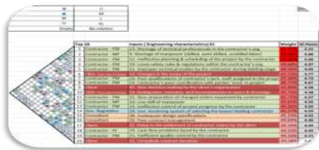
Figure 3. Second Roof House of Quality

The total number of relations was 361 relations were interpreted to points that reflect how each factor of delays interacts or getting influenced by others. An (engineering degree index) was created to represent this kind of relations by giving an independent weight for each factor of delay. The range of degree was (17% to 41%). Figure-3 below shows the degree of relations between all factors of delays.