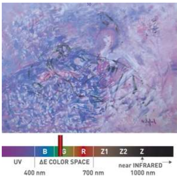
Figure 10. Section cut from animation, lothes with hidden images http://jana.ziljak.hr/figure10.mp4

The dress is designed according to the painting of artist Nada Žiljak. The gradual transformation of the reproduction of fine work from visual V condition to Z condition is shown in continuity by animation. Ten conditions are shot with light blockade which illustrates the appearance and disappearance of individual components of colorants which are inherent to our eye. The original visual work and reproduction of the same one on linen is presented (will be presented) at the Fifth Joint International Conference, 2017. Zurich, Switzerland, using the double VZ camera.