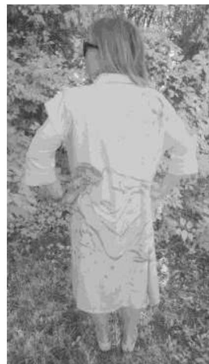
Figure 9. Clothes worn by Jana with Nada's images

We have developed the method of VZ separation which has started with CMYKIR procedure connecting two