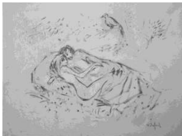
Figure 4. Nada's painting in two spectrums (Z-NIR)

The double state of the painting was photographed with two cameras. The first camera was positioned in visual (V) - RGB (red, green, blue) mode. The second camera was taking photos in near infrared spectrum (Z-NIR) with blockade at 1000 nm. The situation address of two V and Z painting at the exhibition Winterthur (Fig.5. and Fig.6.).