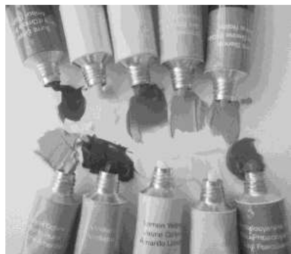
Figure 2. Oil artistic colorants in NIR spectrum