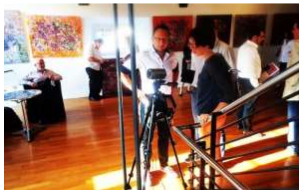
Figure 5. Visitors at the exhibition (visual spectrum)

The double state of the painting was photographed with two cameras. The first camera was positioned in visual (V) - RGB (red, green, blue) mode. The second camera was taking photos in near infrared spectrum (Z-NIR) with blockade at 1000 nm. The situation address of two V and Z painting at the exhibition Winterthur (Fig.5. and Fig.6.).