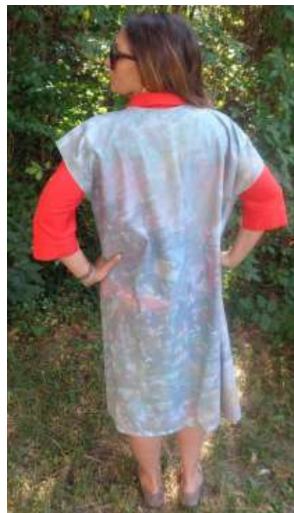
Figure 8. Clothes worn by Jana with Nada's images

characteristics of invisible, hidden image and at the same time they will have NIR protection of the originality of their art work.