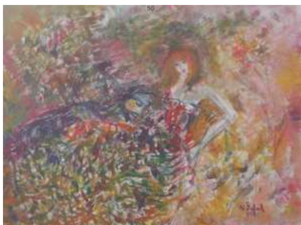
Figure 3. Nada's painting in two spectrums (V visual)

The painting (Fig.3.) was exhibited in Winterthur (Switzerland) at the exhibition called "INFRARED PAINTING" (Kultuzentrum June 14th, 2017.) The surveillanc cameras, with NIR light blockade, were installed at the exhibition room (Fig.5. and Fig.6).