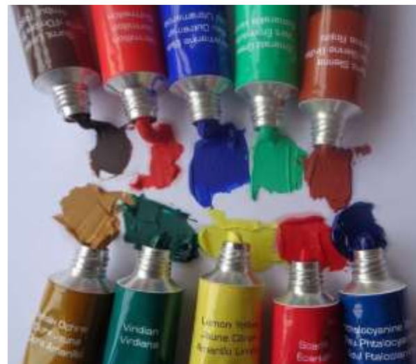
Figure 1. Oil artistic colorants

Fine art is reaching for the new ways of perception of colors and mixing colors. Painters, graphics and artists in the multimedia field are aware of the possibilities of usage of light qualities beyond the range of the naked eye thus creating new painting.