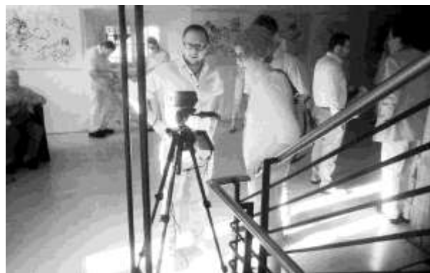
Figure 6. Visitors at the exhibition (Z blockade)