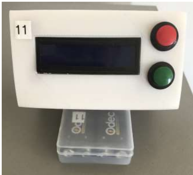
Figure 1. SmartAngels prototype device.

For that, we use two telecommunication networks that are both redundant and autonomous. On the edges of coverage areas, the gateways are connected to reachable public telephone networks (2G/3G/4G/5G?). They allow to communicate in case of emergency. The SmartAngels community actors can take action to provide first aid while waiting for civil protection assistance. Thus, thanks to network meshing, the SmartAngels system ensures an optimal neighbourhood solidarity, and the actors – or first responders – of the system can efficiently help to coordinate emergency management during a crisis. The SmartAngels system allows to overcome technical limits in areas where telecommunication networks are underdeveloped. An example of SmartAngels system architecture is illustrated in Fig. 2.