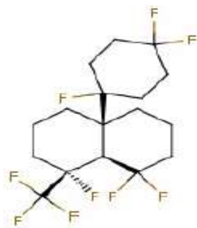
Figure 1: Organic structure of new drug molecule (1,8,8-trifluoro, 1 trifluoromethyl, 4a-(1,4,4-trifluorocyclohexyl) decalin)