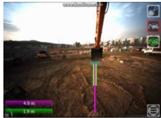
Figure 4. AR Depth Mode