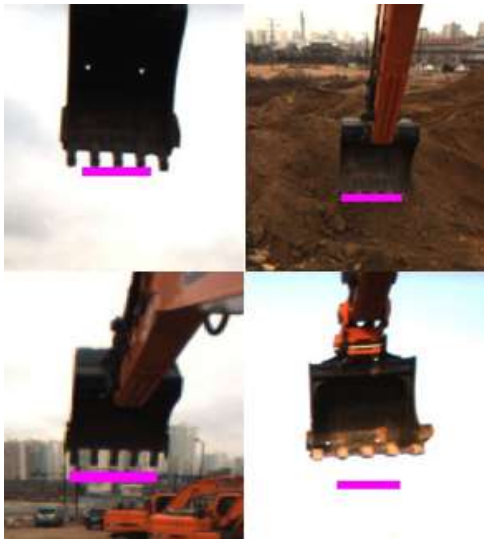
Figure 5. Extrinsic calibration error