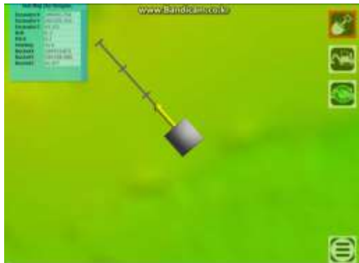
Figure 3. Hub Map Mode