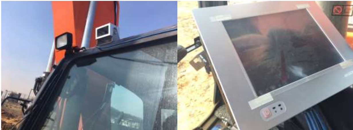
Figure 2. Installed AR Navigator hardware

Both intrinsic and extrinsic calibration has enormous effects on the realization of AR Depth. Intrinsic calibration calibrates errors inside the camera by figuring out focal length, principal point, and distortion inside the camera. The current AR Navigator had a pixel error (RMSE) of 0.99 thanks to intrinsic calibration. Extrinsic calibration calibrates errors by obtaining information about the camera coordinates on the global coordinates and the viewing position of the camera. In the study, 131 photographs were used in the test, whose results led to the current AR Navigator's 11.4 pixel error (RMSE) thanks to extrinsic calibration. Fig. 5 shows the images of actual extrinsic calibration with purple lines on images. The results indicate that 11 pixel errors or so will not cause much