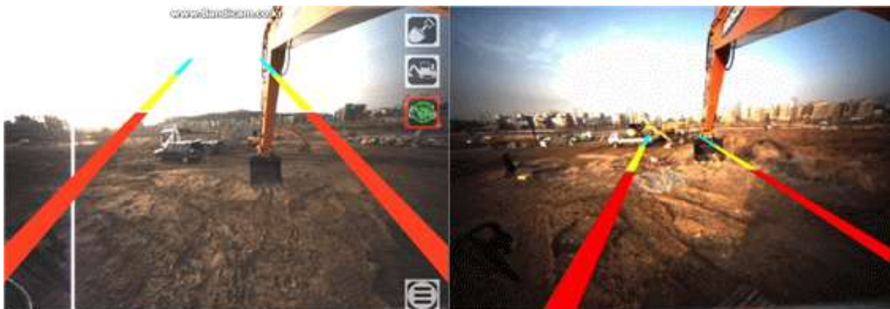
Figure 6. AR Radius mode before and after the application of excavator position information

If the AR Navigator is actually used in the field, it will contribute to the incredible increase of job efficiency at the construction field. In the end, it will serve as the AR system applicable to all equipment and a basic system for the automation of processing in civil engineering.