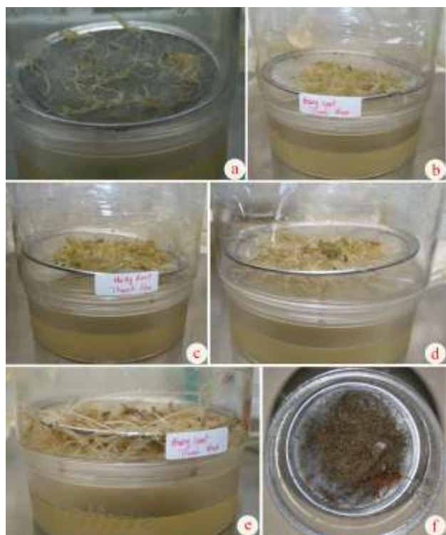
Figure 2. Dynamic of root growth in temporary immersion bioreactor at the dates after cultivation 5 (a), 10 (b), 15 (c), 20 (d) 25 (e) days and f was control