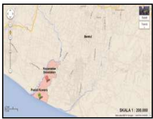
Figure 1. Research area in Srandakan, Bantul, DIY Province

The aim of the project is to design a system to compress and store biogas in such a way that it will be suitable for cooking gas in rural communities. This research is focused on energy conservation area in Srandakan, Bantul, DIY (see fig. 1).