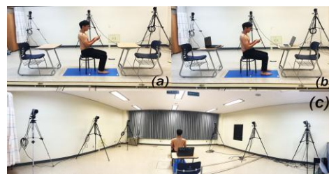
[Figure 3] Experiment setting ; (a) Non feedback (b) Visual feedback (c) Panorama