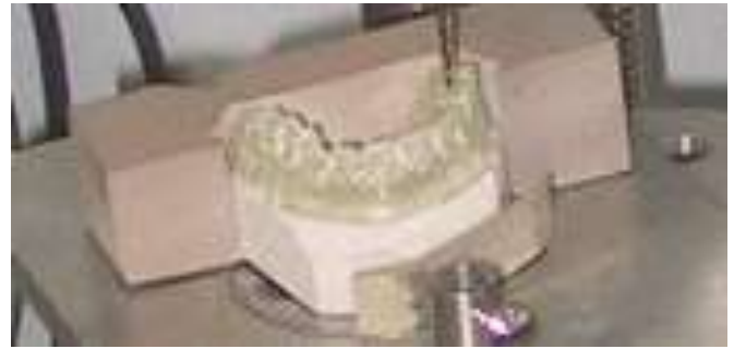
Figure4. Complete hole made by the DDTS

The accuracy of the robotic systems is measured. The repeated Positioning accuracy is \pm 0.01 mm for a single manipulator and \pm 0.10 mm for the whole DDTS. In Figure 5 the complete hole made by the DDTS system position and resolution accuracy were illustrated.