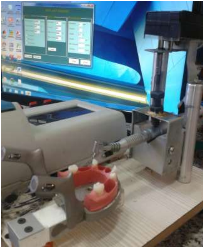
Figure 1.DDTs COMPONENTS

The advantages of automated test systems overcame many problem of surgical difficulty. They increased dexterity, restore proper hand-eye coordination and an ergonomic position, and improve visualization .In addition by using, this system it made dentist possible to solve. technically difficult or unfeasible works, Dental drilling test system (DDTS) is an agile manipulator robot system for monitoring and testing implant surgical process that developed using 2DOF (degree of freedom) in our project.