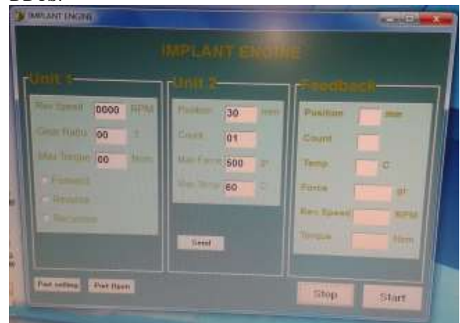
Figure2. The monitoring system in DDTS

system performance. The test system control software was programmed based on BASCOM microcontroller program language. The functions of the control software were used to calibrate drilling initial position for drill position arrangement, creating control data profile for the drill position and feed rate with the control the system performance operation. Experimental procedures thoroughly tested and evaluated before animal testing or human clinical trials on virtual jaw's blocks. The maximum vertical force of this t system was 200 N, the maximum RPM of motor drilling speed was 250, and the repeated positioning accuracy was \pm 0.01 mm. In vitro experiments were accomplished for this complete system was implemented by using ITI drilling sequence (Straumann®, Sweden) system. The completed drilling for upper as well as lower on jaw of sheep were accomplished with uses of no clinical experience Figure 2 showed the In vitro working process of the single DDTS for complete Drilling process. The stability structure and workspace analysis of DDTS in drilling process were studied. Because of the variable amount of driven motors, was difficult to realize the control and kinematic calculation of this system with kinematic software. Aiming at this problem, for drilling performance strategy was proosed based on the combination of computer decision and dentist analysis with data monitoring system in DDTS as it showed in Figure 2 the monitoring system in DDTS.