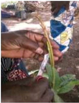
Photo 3: Single slot grafting

those applying side or veneer grafting (83.6%). Single slot grafting technique has been taught to grafters during phase I of iCA and applied by most of them. However an adaptation was experimented as veneer/side grafting. This technique in fact, allows having a larger contact surface between the cambium of the rootstock and the scion. Therefore, response is a best recovery rate of the grafted seedlings on all nurseries which practiced that in comparison with single slot. One can conclude that this type of grafting leads to better recovery rates in Benin conditions. The same results were observed on the field for top-working operations granted while implementing GIZ /ACi Matching Fund project by Cashew Regional Producers Union (URPA) of Borgou-Alibori from 2013 to 2014 in Benin [7].