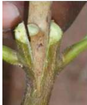
Photo 4: Side grafting technique

As far as the other observations in the nurseries are concerned, it has been possible to understand.