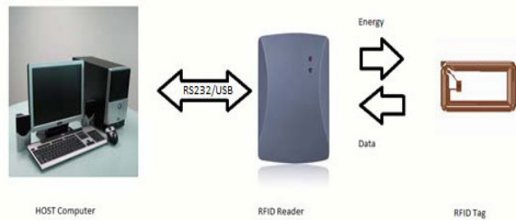
Figure1. RFID System

The system will also assist book borrowers to issue and return multiple books at a time by themselves reducing the time and effort of the librarian. The system employs RFID technology as a medium of an identification technique.