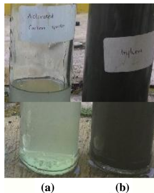
Figure 3 Comparison for Visual Turbidity of Samples; (a) AC Reactor and (b) Waste-Washing Wastewater (3W)

According to Figure 3 shown above, there is a very significant difference between each bottle of sample, that it can easily depict from the picture that the effluent water discharged from Compost Adsorption reactor (Figure 3, a) is show that most turbidity has been removed away during the detention time in the Compost Adsorption reactor compared to the 3W turbidity (Figure 3, b).