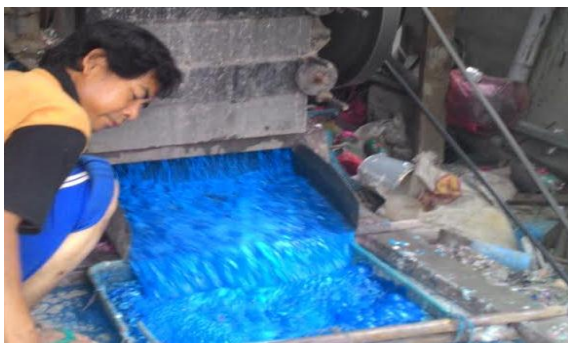
Figure 4 Waste-Washing and Grinding Process in MRF Zero Waste Indonesia (The Blue Colour is The Waste Being Washed)