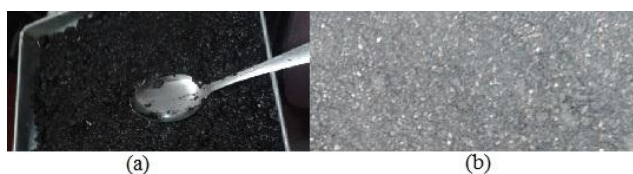
Figure 5 (a) Compost Char Paste, (b) Compost-Based Activated Carbon (CBAC)

According to this experiment, compost chars (see figure 5, a) stand for the char or black-burned grains those produced after burning the compost grains in a 200-250°C oven for 1.5 to 2 hours long. Since the grains of compost have been filtered first, they have quite uniform grain size unless there was careless filtering process so that there are still coarse grains mixed. Compared to the making of typical common activated carbon from corn stillage or coconut shell, the making of compost char is far and a lot quicker as it only takes a half-time (or more) of coconut shell or corn stillage 4-hour to 6-hour charring [9] Gomez, n.d.). The heat required is also much lesser than the heat of it is commonly required, since according to Tsui and Roy (2008), the temperature of pyrolysis (charring) required for corn stillage reaches 900°C.