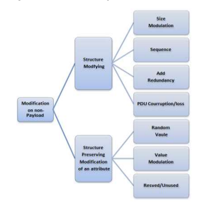
Fig 2: Non-Payload Storage Covert Channel Classifications[6]

Due to the diversity of the network storage covert channel, Wendzel et al. classify them in two branches: (i) network storage channel methods that hide the covert message in the payload, and (ii) the network storage channel methods that alter non-payload aspects such as header fields [6]. Accordingly, Wendzel et al. classify the non-payload methods into seven patterns, as illustrated in Fig 2. On the other hand, the covert timing channels are classified into four patterns, as illustrated in Fig 3 (overleaf).